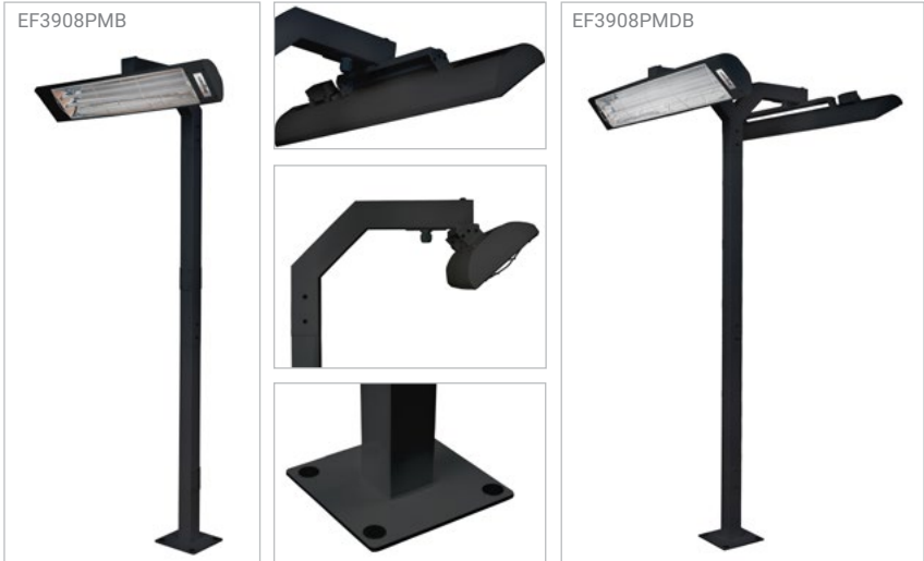
Single Head Mount